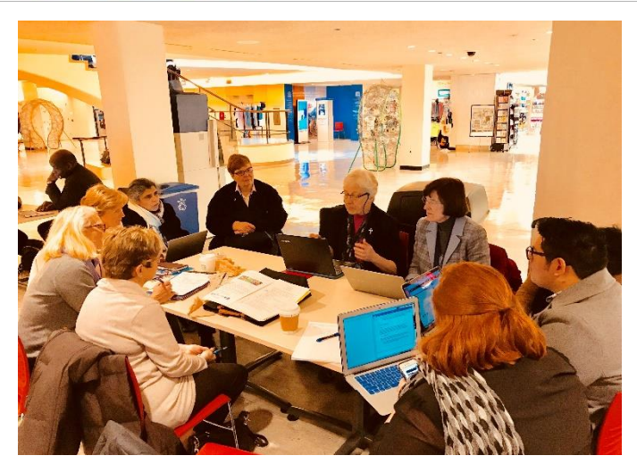
The Grassroots Task force meets in the UN Café in preparation for the CSocD Side event

outreach and engagement between governments and civil society. An interesting part of the survey asked NGO respondents to rate progress to date in their countries on SDGs 1,2,3,5,9,14 and 17. This assessment yielded missed results. The most common response was that "a little progress" had been made. In some cases, however, NGO respondents believed that situations had worsened. The most negative assessment was on Goal 14 on water and oceans. The table is reproduced here.