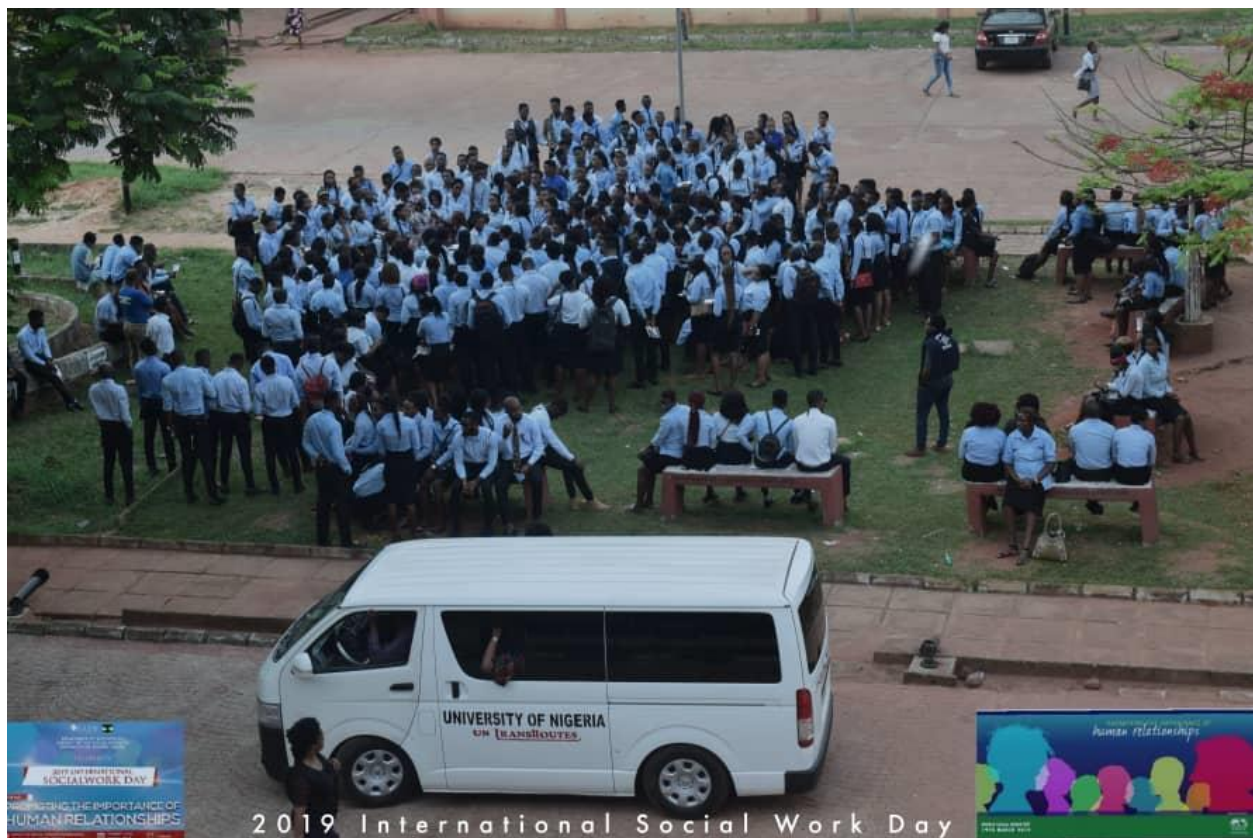
Pic 1: Aerial view of students of the Department of Social Work on 2019 Social Work day

In recent years, the University of Nigeria has made commitments to join social workers all over the world to celebrate the social work day. This has always been fruitful as a result of the collaboration between the student and staff bodies. In the past, radio programmes and rallies have featured strongly, in helping to create awareness about the profession within an environment not fully abreast of what it is. Generally, the department has benefitted from this, especially in the increase of its student population and a fast-growing recognition of the course as a very important one within the university environment.