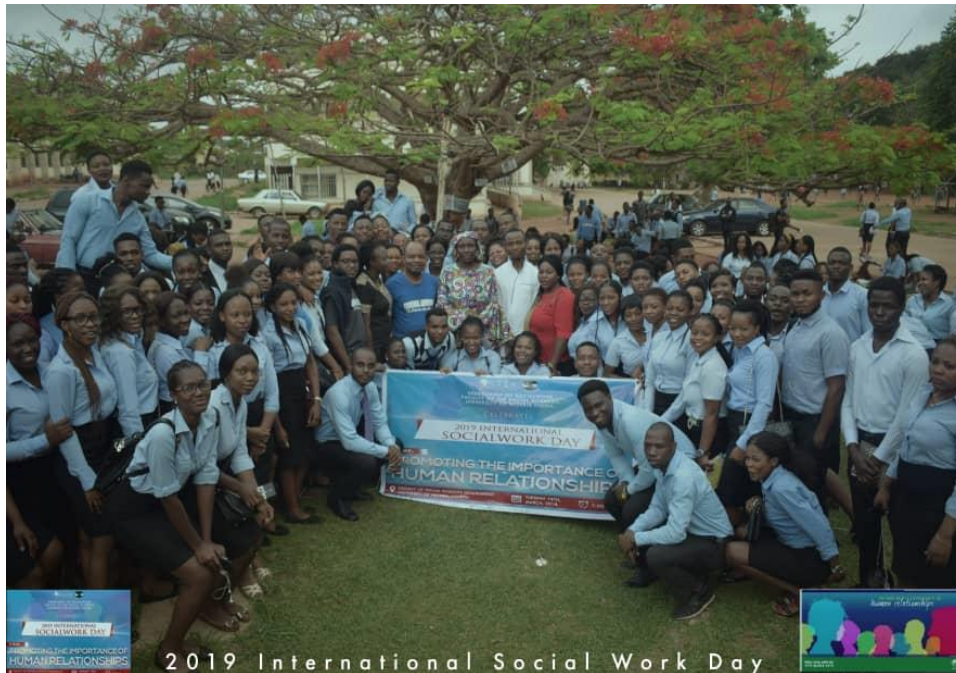
Pic 4: Cross-section of students with some staff of the Department and the Head of Department