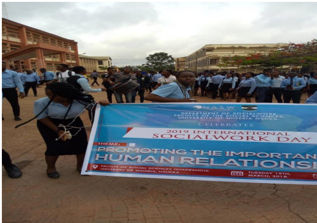
Pic 5: The students in rallying mood