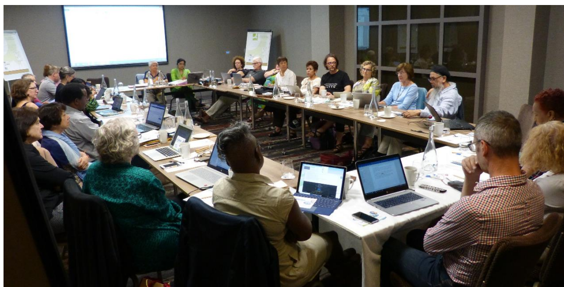
Figure 1: IASSW Board Members during Board Meeting in Dublin, Ireland

Dublin Board Meeting was held on July 1-3, 2018 at Clayton Hotel, before the conference. Current and past Board Members attended the Board Meeting. The meetings were fruitful and had good discussions.