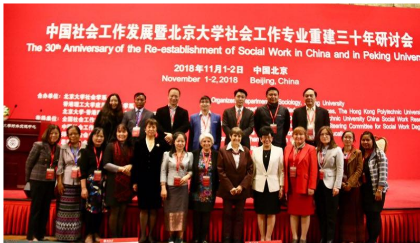
Figure 14. Closing ceremony

We hope that China social work education will have a further development responding to the need of the society and can develop a stronger participation and contribution to the International Association of Schools of Social Work