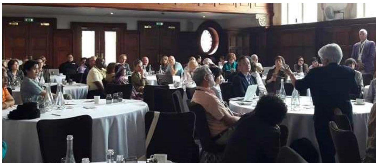
Figure 3: President addressing IASSW General Assembly in Dublin

difficult period in which I've to navigate maintaining a firm position in relation to the dynamic between IASSW and IFSW.