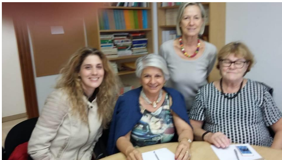
Figure 13. The LOC team at work