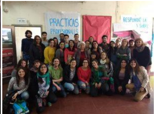
Figure 12. Open lecture at