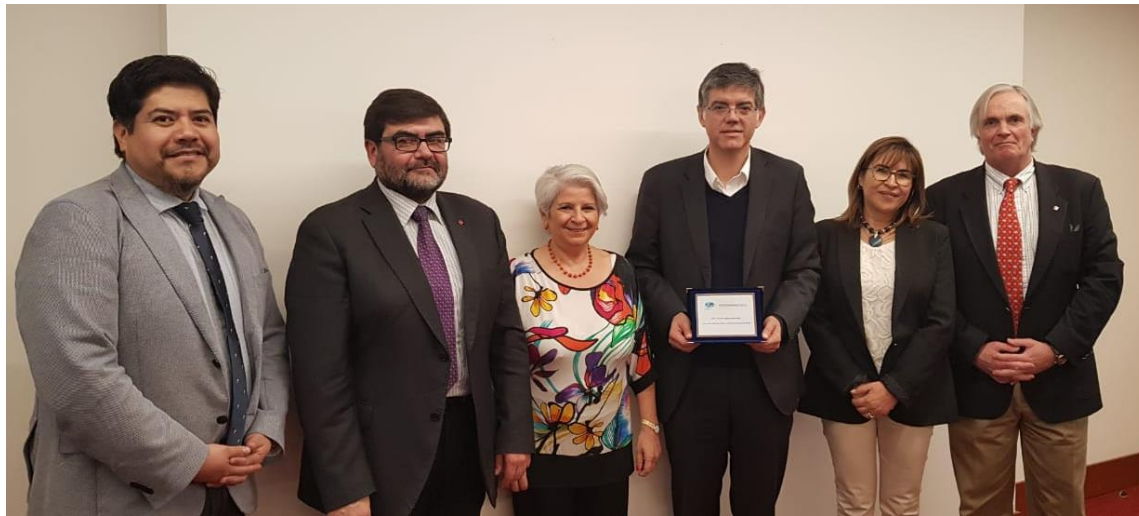
Figure 8: Meeting with the Rector and the University Board of INACAP

In Santiago (Chile) , I met the Rector of INACAP and representatives of the different schools, with the purpose of organizing a process of curricula evaluation.