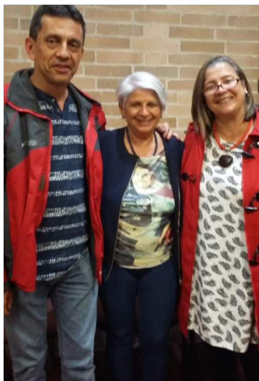
Figure 10: The newly elected Board of ALEITS