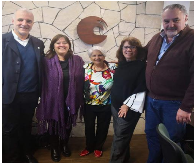
Figure 11. Meeting with the Rector at Mar del Plata Buenos Aires Univ.