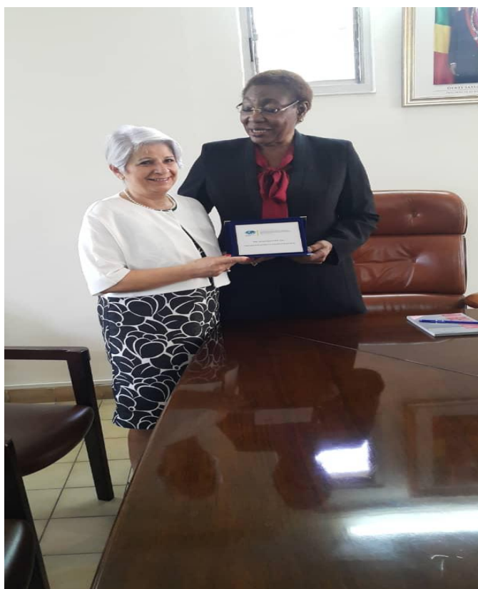
Figure 18- Minister Antoinette Dinga Nzondo

During my stay I've also met the Minister of Social and Humanitarian Affairs of the Republic of Congo and attended the Seminar on exchange of experience in building schools of social work in Africa, organized under the leadership of Abye Tasse. I've presented IASSW history and activities, underlining the support that we can offer in capacity building and the importance of being member of this international community.