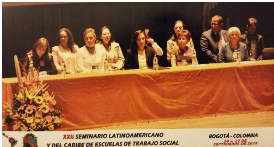
Figure 9. Opening ceremony