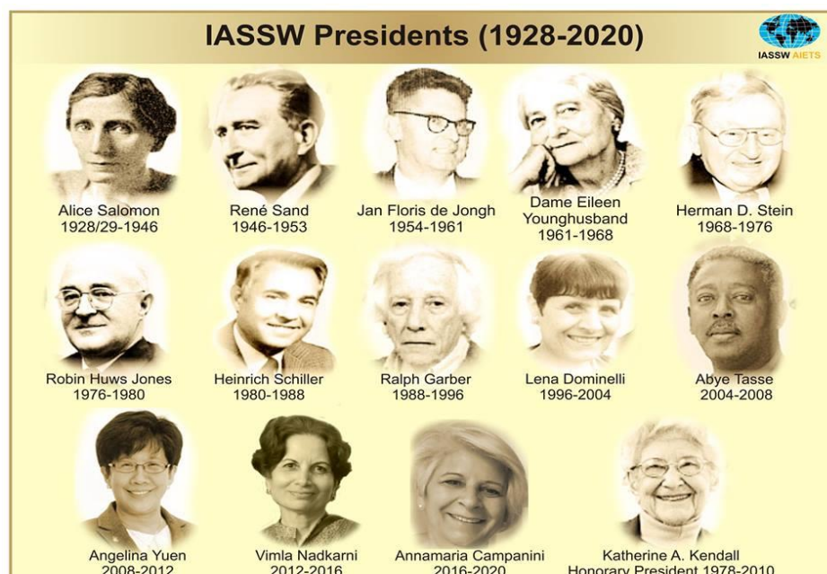
Figure 4: Poster of IASSW President (1928-2020)