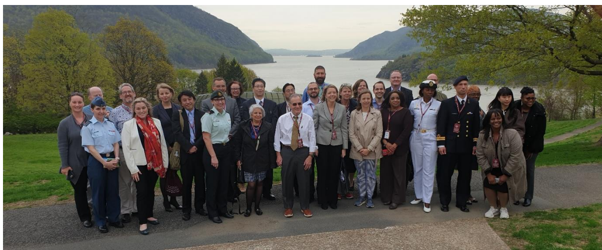
Figure 11: Delegates of International Military Social Work Conference