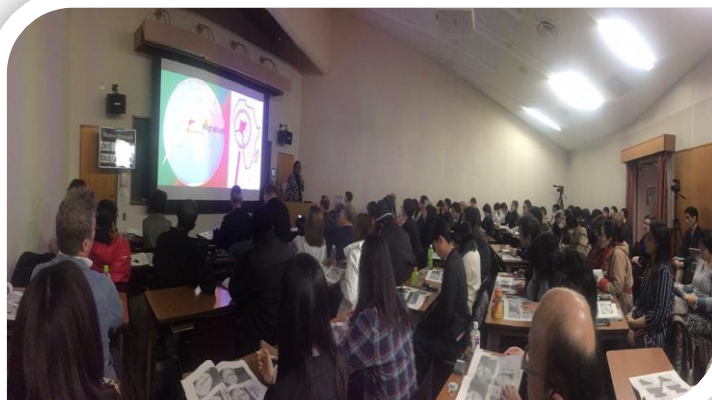
Figure 3: Delegates at mini conference

On 10th January, 2019 colleagues from Shukutoku university invited IASSW Board Members for a round table about the future of IASSW and the possibilities to strengthen the relationship with the Japanese members. We had the possibility to visit the university and to meet the dean. The discussion was interesting and fruitful.