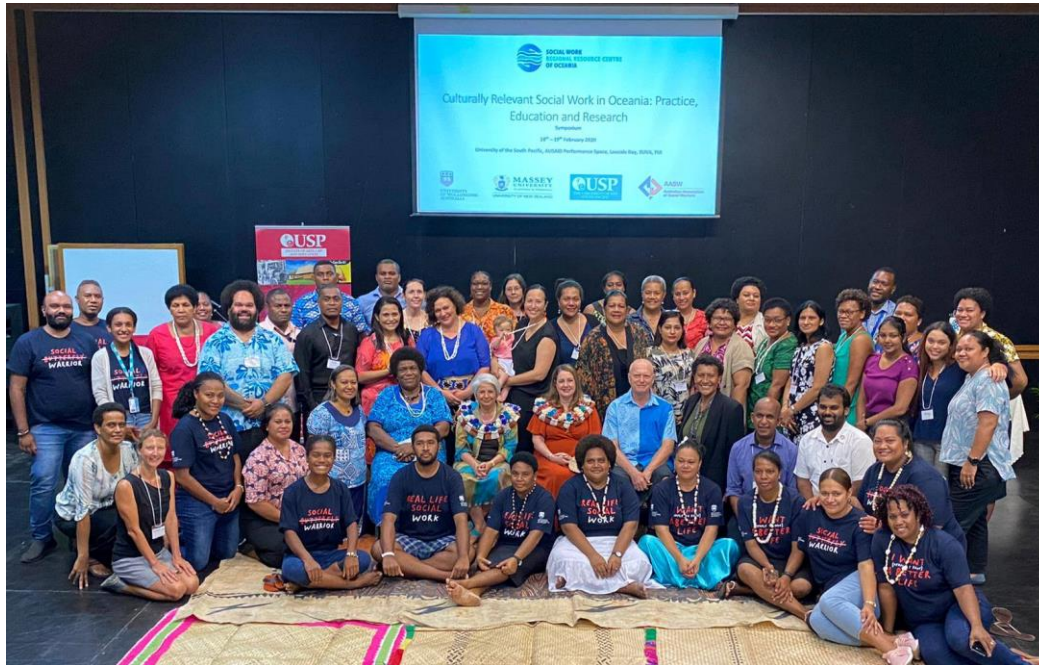
Figure 2: A group picture with participants of Symposium

I was invited to participate to the Symposium on Culturally relevant social work in Oceania: Practice Education and Research, organized by The Social Work Regional Resource Centre of Oceania. This has been a really interesting meeting where we could exchange experiences and discuss the relationship between indigenous knowledge and international dimension of social work.