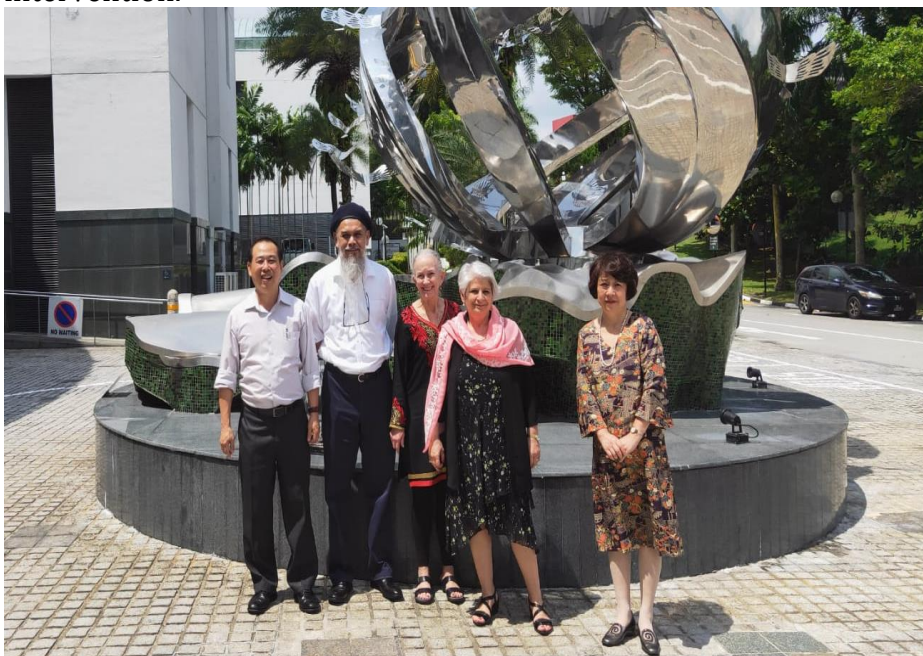
Figure 1: IASSW Board participated in Singapore conference

I participated to the International Social Work Seminar on “Strengthening the Family: Global Social Work Perspectives”, organized by Tan Ngoh Tiong, with a speech on “Working with Families across Cultures: An Empowerment approach”. This includes the strengths perspective, family group conference, dialogical evaluation and social work intervention.”