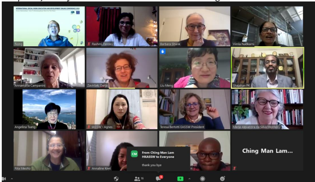
Figure 3: IASSW Board Meeting

15 th /16 th January Kick off ISWESD and Board meeting