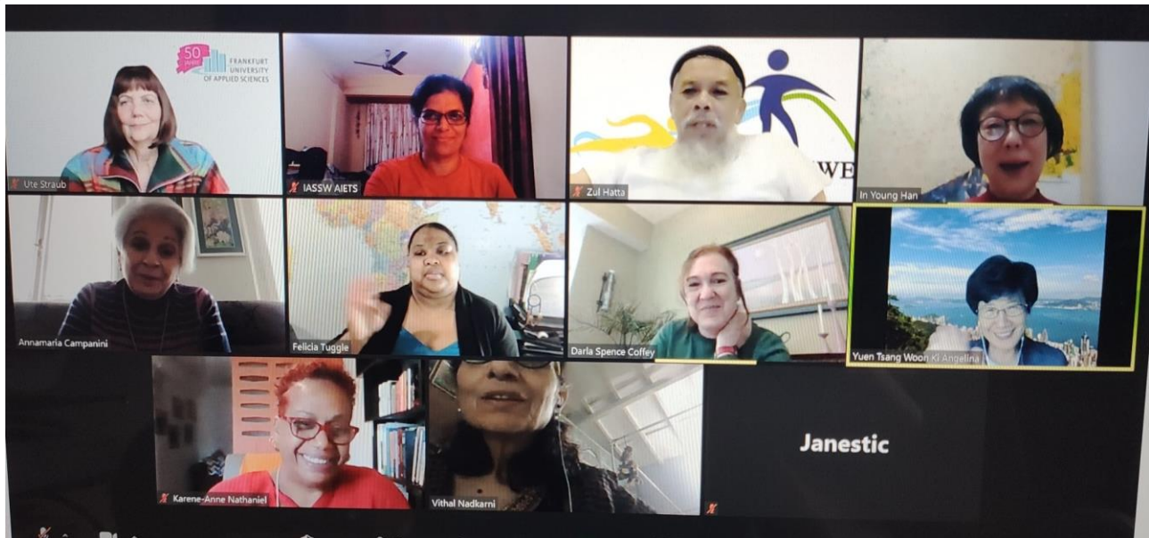
Figure 4: Meeting with Capacity Building Committee