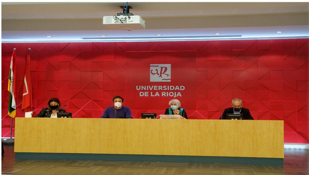
Figure 9: At University of La Rioja Spain