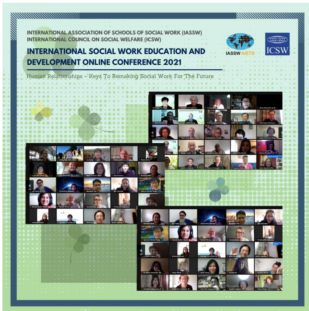
Figure 2: A group photo of participants during ISWED keynote speech